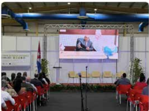
7:39 AM · Jun 24, 2022 · Twitter Web App

International Solar Alliance @isolaralliance DG, ISA virtually addressed the opening ceremony of 2022 Renewable Energy Fair being held in #Cuba from June 22-24. #ISA & #Cuba are working together for establishing a capacity of 1150 MW across 175 #solarenergy projects under ISA's #SolarParks Programme.