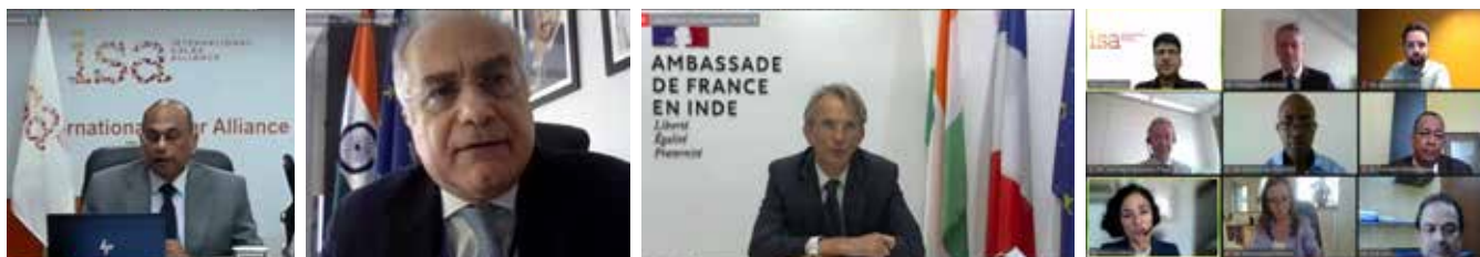
Glimpses from the virtual launch

Two flagship projects on capacity building were launched virtually on 27 June by the European Union and the Government of France in the presence of H.E. Mr Ugo Astuto, Ambassador of the European Union to India; H.E. Mr Emmanuel Lenain, Ambassador of France to India; and Dr Ajay Mathur, Director General, International Solar Alliance. The European Union and Ministry of Europe and Foreign Affairs, Government of France, are supporting ISA by building the capacity of ISA and its Member Countries through Solar Technology Application Resource Centres (STAR-C) and by deepening cooperation between ISA and ISA Member Countries and the European Union solar energy-related businesses, academic networks, and financial institutions.