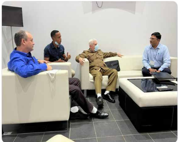
3:52 AM · Jun 24, 2022 · Twitter Web App

International Solar Alliance @isolaralliance ISA representative met with Hon. Vice Prime Minister of Cuba & Commander @ValdesMenendez & Hon. Minister of @EnergiaMinasCub @arronte_livan on implementation of 1150 MW Solar Projects in #Cuba under aegis of #ISA programme 06 along with @ntplimited