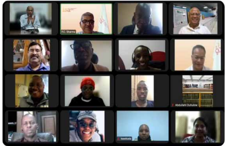
10:27 AM · Jun 14, 2022 · Twitter Web App

Global Sustainable Energy Solutions India @GSESIIndia @GSESIIndia in collaboration with @isolaralliance delivered the 8th batch of 5-day Online Training on Solar Systems for Bankers of ISA Member Countries. 40 participants from 4 different countries and 15 different banks participated in this training program.