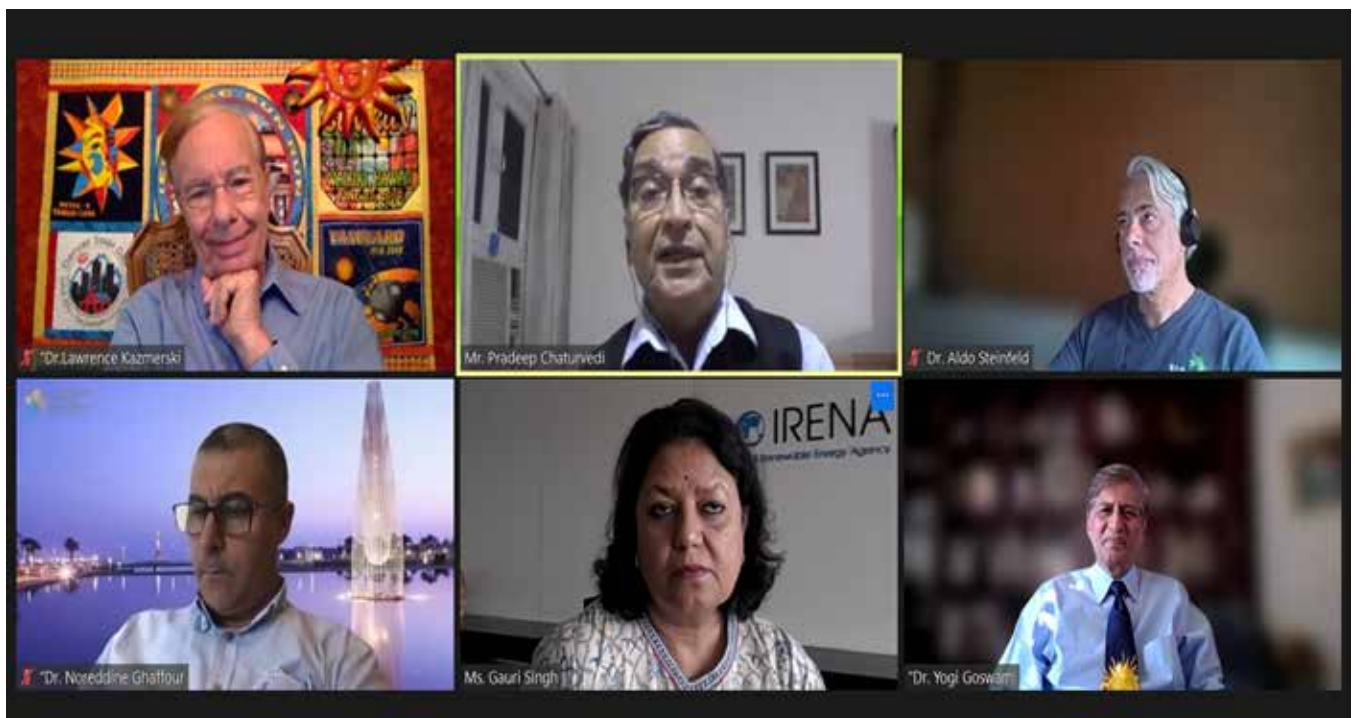
Glimpses from the virtual launch