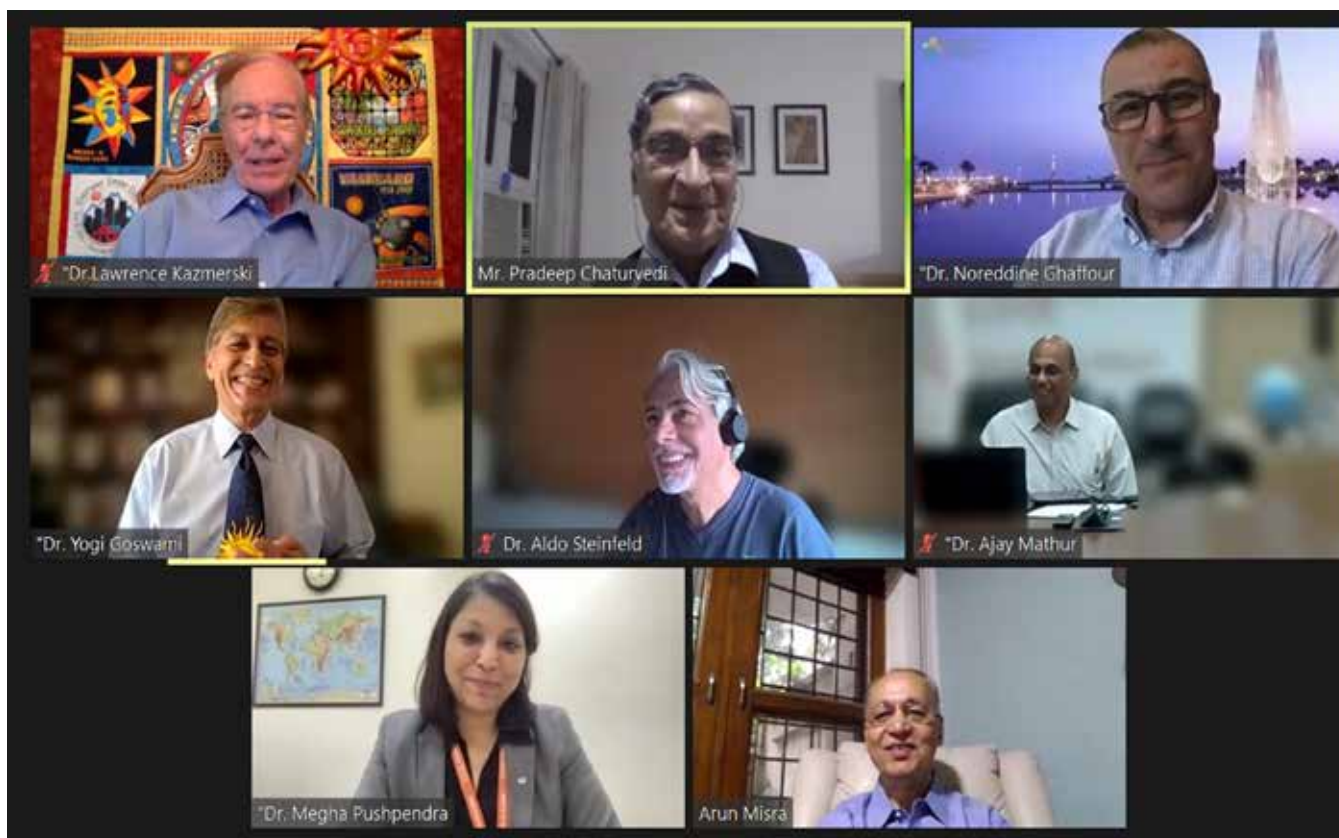
Glimpses from the virtual launch