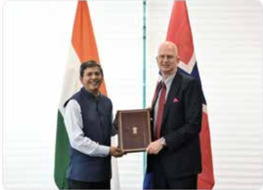
11:56 AM · Jun 3, 2022 · Twitter for iPhone